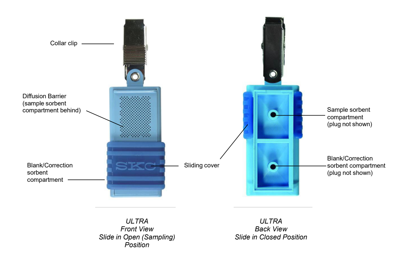
Figure 1. ULTRA Passive Sampler with Blank/Correction Compartment